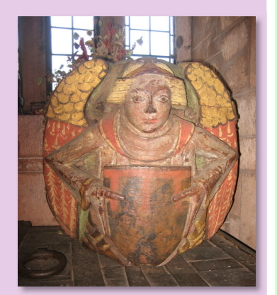
Where would you go to admire this Boss?